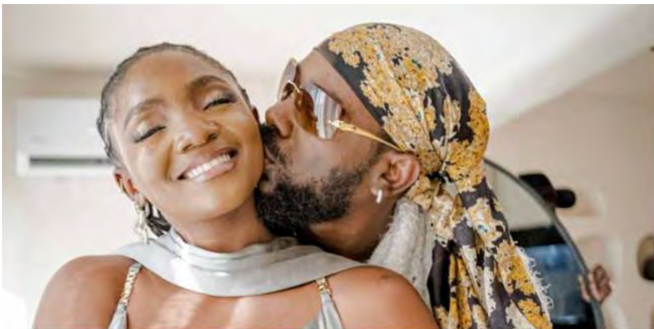
Simi & Adekunle Gold

has not yet revealed the gender of the newborns, their announcement has sparked an outpouring of congratulations from admirers, fellow celebrities, and colleagues in the music industry. Speculation about the pregnancy began in December when Simi shared a video on Instagram captioned, "From my baby, for my babies," showing